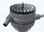
Rotary sprinkling plate