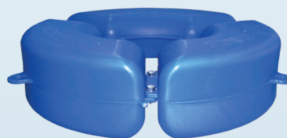
3 pieces coupled floater